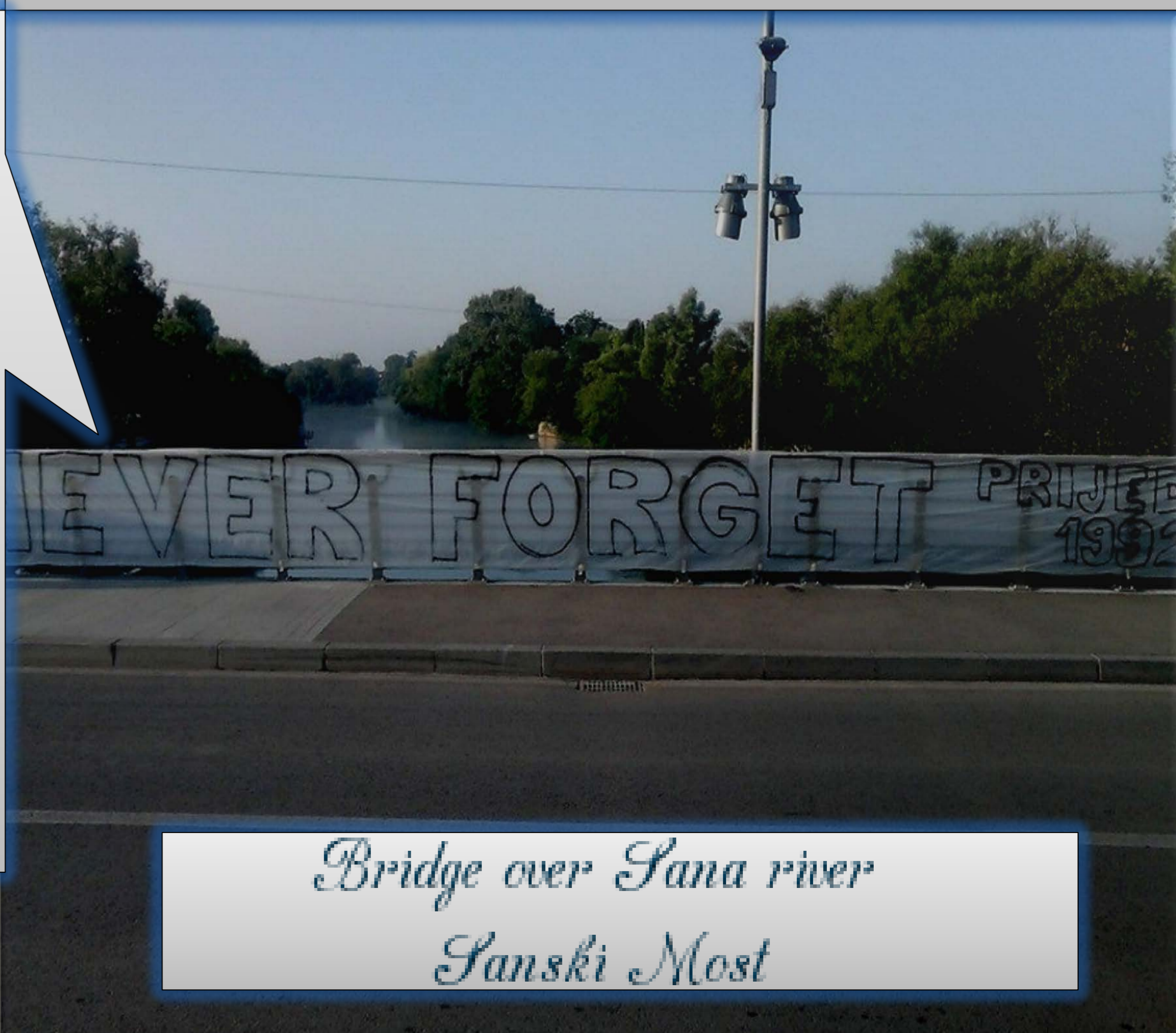
Bridge over Sana river Sanski Most

As a main outcome of the project a nexus between state-building and reconciliation is proposed, one that links the establishment of institutions and political arrangements with the implementation of ground projects that are aimed at peaceful coexistence and interethnic reconciliation between Bosniaks, Bosnian-Serbs and Bosnian-Croats.