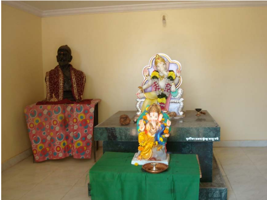
Figure 2: The Maharashtrian king Shivâjî and two images of Ganesha, the elephant God.