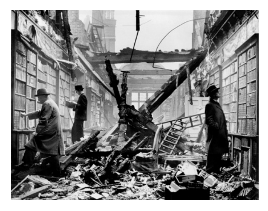
Figure 1 Holland House Burned

concerned with here and about the scholars trained as historians of art in order to reconstruct the events they lived through and how, amidst the horrors of a war that threatened both their new home and the previous world they had known so well, these experiences affected what, as scholars, they did. To speak of such matters is to venture on an enquiry that is at once intellectual and yet personal and perhaps, in that last regard, presumptuous. But the personal is always part of what we might call public history. And my interest in these matters stems from my own experiences that may excuse any my intrusiveness; that I grew up in London in the aftermath of the war with the images of the destruction of the city so firm in my memory that they are with me still; and that later, as a graduate student at Columbia University in the 1960s, I had the privilege to study with several of these scholars and talk to them, if briefly, about their memories of those terrible events in Britain and beyond.