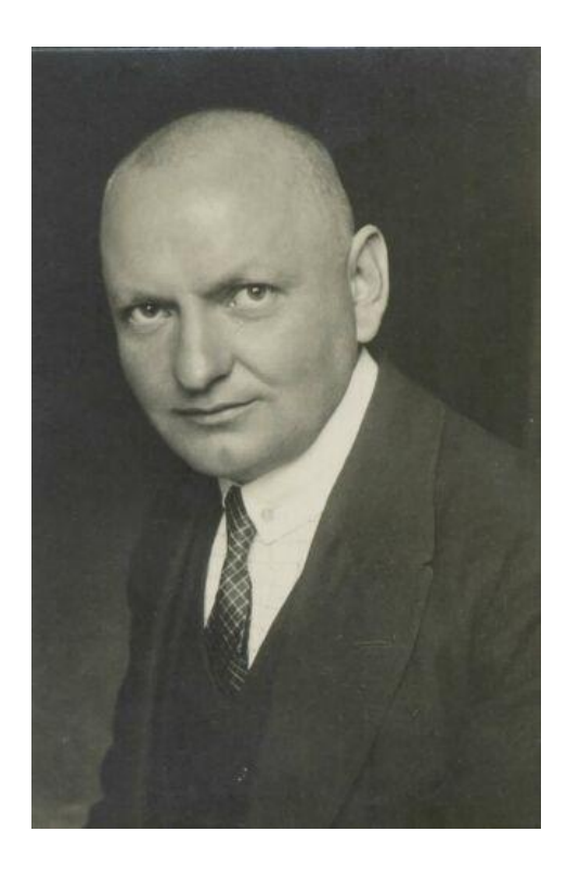
Figure 7 Izidor Cankar, National and University Library, retrieved from http://www.dlib.si/?URN=URN:NBN:SI:I MG-ED8JN94S