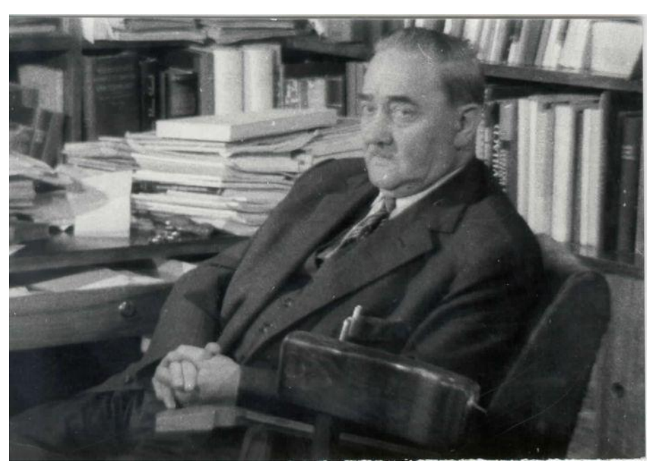
Figure 5 France Stele (1963)

Avgust Žigon, as the first to guide him along this path.<sup>44</sup> Afterwards, he explicitly mentions Dvořak and Strzygowski as the two teachers in Vienna who began to reveal to him the secrets of art but he was unable to fully grasp them back then. He claims to have achieved that during his captivity in Russia when he came in contact with representatives of living, revolutionary modern art.<sup>45</sup>