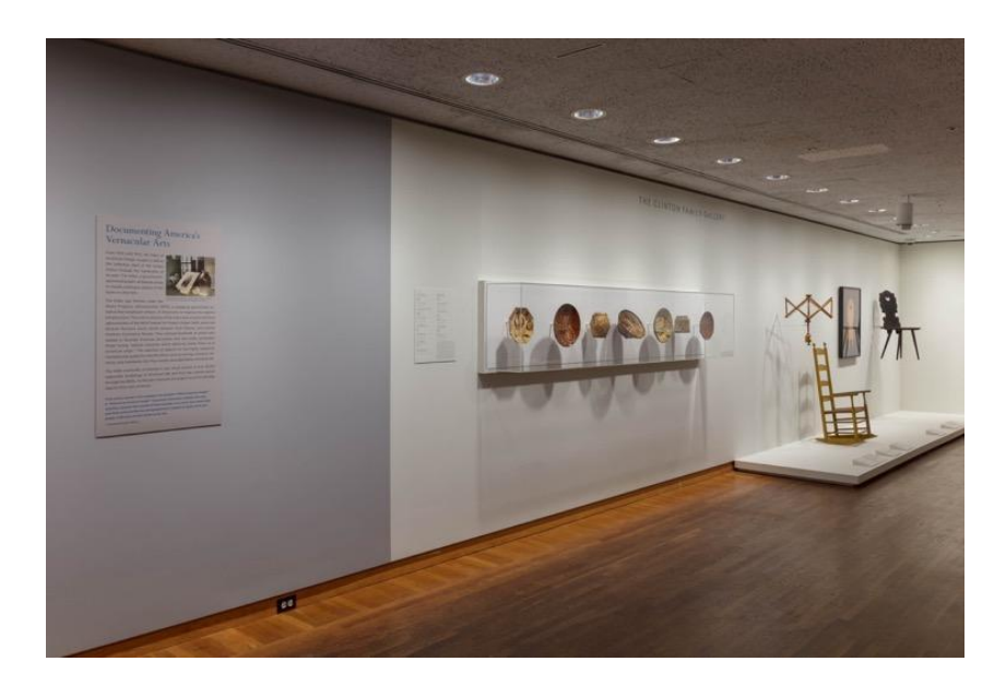
Figure 2 Installation view, Index of American Design section: Photography and Folk Art , Sep 21, 2019–Jan 19, 2020, The Art Institute of Chicago.

Such a wide-ranging, ambitious project required a robust organizational structure. The artists and administrators arranged the work by material classification, as one would a regional taxonomy of flora and fauna, and developed an elaborate reference system that included material type, location, and number within each series. Medium classifications such as wood carving, ceramics, furniture, and metalwork were further grouped by subject, like domestic and household arts, Pennsylvania Dutch crafts, rugs, and Spanish-American crafts.<sup>5</sup> Notably, however, Native American art was excluded from the assessment in the name of keeping the Index manageable—but also due to internal prejudices against such work as 'ethnographic' and thus covered elsewhere.6 In our exhibition, which featured not the Index's drawings but the kinds of objects they illustrated, we highlighted the original project's typologies in the installation and called attention to the absences in the accompanying texts (see fig. 2). Carved duck decoys and wooden birds, redware pottery, and metalware were all displayed by classification in a comparative style intended to emphasize their aesthetic rather than their utilitarian qualities. A Shaker swift and a Zoar side chair hung from the wall like paintings, downplaying function to spotlight form.