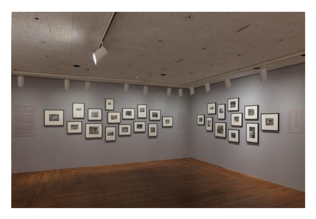
Figure 3 Installation view, Farm Security Administration section: Photography and Folk Art , Sep 21, 2019–Jan 19, 2020, The Art Institute of Chicago.

The Index's taxonomic approach to culture was further underscored in the exhibition by juxtaposing the objects against a cloud of documentary photographs on the opposite wall (see fig. 3). These photographs—all made under the auspices of the Resettlement Administration (RA, 1935–1937), later reorganized as the Farm Security Administration (FSA, 1937–1942) - represented just a fraction of the most comprehensive effort to that date to document American life and culture. Based in the Department of Agriculture, the RA and FSA provided relief and assistance to rural Americans during the Depression. Roy Stryker, a photographer and economist, headed the program's Historical Section, which was founded to record multiple crises of the nation's agricultural economy during the 1930s, and the government's attempts to address them. The photographs found immediate use in a wide range of contemporary publications, exhibitions, and educational settings, but as the name of the program suggests, it was also designed with an eye toward posterity, and indeed evolved into a historical record of everyday American life. At least twenty photographers worked for the program during its run, producing nearly eighty thousand images—an unequaled national image bank of the Great Depression and the American recovery that continues to resonate today.