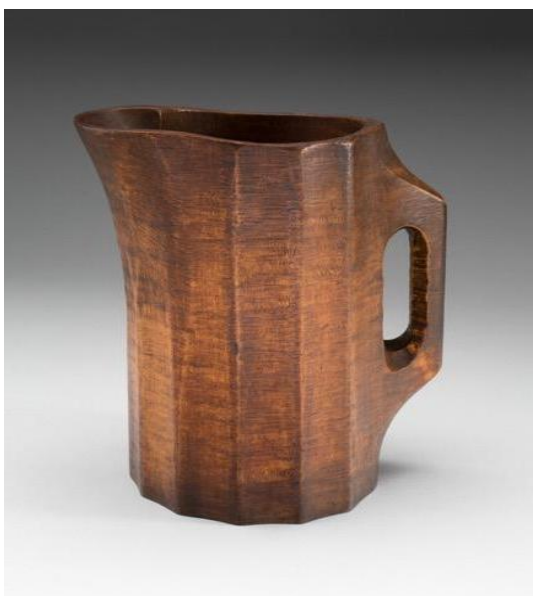
Figure 6 Walker Evans (American, 1903–1975), Alabama Cotton Tenant Farmer Wife , 1936, printed c. 1962, Gelatin silver print, 21 × 17 cm (image/paper); 45.7 × 35.6 cm (mount), The Art Institute of Chicago, purchased with funds provided by Mrs. James Ward Thorne, 1962.158. © Walker Evans Archive, The Metropolitan Museum of Art. Figure 7 Artist unknown, Pitcher , c. 1820–1860, Maple, 21.6 × 18.4 × 12.7 cm, The Art Institute of Chicago, Thorne Rooms Exhibition Fund. 1946.760.

Evans was not alone in these interests; indeed, in the process of developing the exhibition we created a network map of the many collectors, critics, curators, and dealers invested in defining, elevating, and circulating American folk art. At the forefront of this widespread effort was Halpert; when she opened the American Folk Art Gallery with Cahill in 1931, it was the first commercial gallery dedicated entirely to this material. Cahill had been immersed in the field longer than Halpert; as she later attested, 'a lot of other people got there before me. I did not invent folk art.' She did, however, remove it from the context of antiques, emphasizing its potential to inspire contemporary artists. As she noted in the press release for the