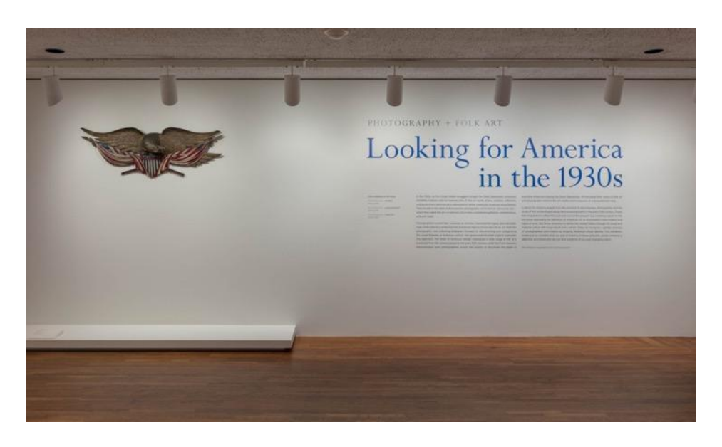
Figure 1 Installation view, exhibition introduction: Photography and Folk Art , Sep 21, 2019–Jan 19, 2020, The Art Institute of Chicago.

Photography and Folk Art grew out of collaborative inquiry into the expanding artistic landscape of the early twentieth century (see fig. 1). The exhibition included over one hundred works of photography, decorative arts, painting, sculpture, and