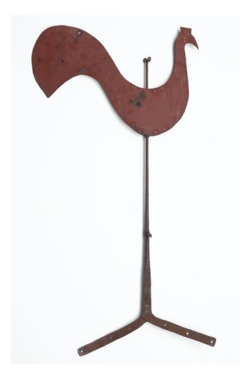
Figure 9 Installation view of the Downtown Gallery, undated folk art exhibition, Archives of American Art. Figure 10 Artist unknown (American, nineteenth century), Peacock Weather Vane , 1800/60, Iron; 131.8 × 71.1 × 2.5 cm, The Art Institute of Chicago, Elizabeth R. Vaughan Fund, 1952.549.

These objects and images from everyday life inspired new collectors—both individual and institutional—to shape a more expansive vision of American art. Photography and Folk Art thus developed into an opportunity to reflect on the Art Institute's collecting histories. In the museum world, exhibitions of folk art did not take place with any regularity before the 1930s, and these pioneering exhibitions were often based on the groundwork laid by individual collectors and dealers. <sup>15</sup> As early as 1924, the Whitney Museum opened Early American Art , an exhibition of folk art from the collections of American modern artists; that same year Viola and Elie Nadelman opened the Museum of Folk and Peasant Arts, widely considered the