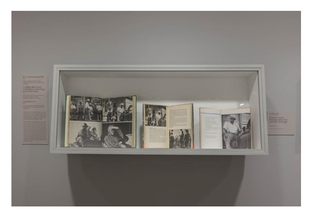
Figure 5 Installation view, publications featuring Dorothea Lange's Plantation Owner, Mississippi Delta: Photography and Folk Art , Sep 21, 2019–Jan 19, 2020, The Art Institute of Chicago.

Gee's Bend, Alabama, an isolated community of formerly enslaved people and sharecroppers who maintained unique customs and language (fig. 4). Rothstein was Stryker's first hire for the fledgling Historical Section, and in 1937 he traveled on assignment to Gee's Bend to illustrate the region's conditions before the impact of farm aid and new housing supplied by the government. Girl at Gee's Bend portrays Bendolph looking out of a window insulated against the weather by only newspaper advertisements. As Rothstein explained, 'You see the girl-that's effect one. You see the ad—that's effect number two. But the third effect is when you see both images together and recognize the irony.'8 In 1940 Richard Wright acquired this print from the FSA while planning his book 12 Million Black Voices, which united his prose on the experiences of African Americans with powerful images from the archive to reveal the lasting effects of slavery and advocate for racial justice. 9 This photograph—and, elsewhere in the exhibition, a series of photobooks showing various iterations of Dorothea Lange's Plantation Owner, Mississippi Delta, Near Clarksdale, Mississippi, 1936 (fig. 5)—allowed us to explore how images of everyday Americans during the Depression moved from the file to the page, finding new viewers and circulating the ethos and aesthetics of Stryker's program.